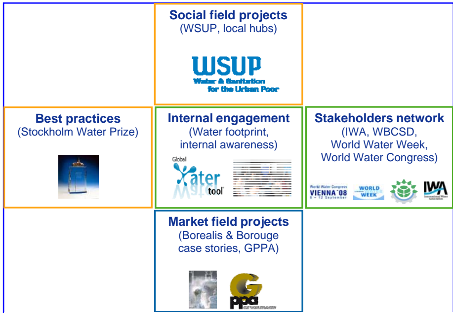
Fig.1.The five main strands of the “Water for the World” programme ( www.waterfortheworld.net )

The above figure shows the main elements of the current programme and the linkages to other partner organisations. These partnerships will increase as the programme develops around the world.