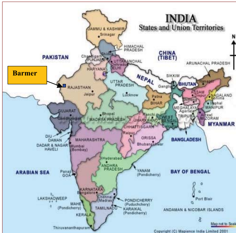
Fig. 2 : Location of Barmer District, Rajasthan

Field Testing of the Unit: The Barmer District in Rajasthan State (Fig. 2), where people walk few kilometers to fetch drinking water was ravaged by excessive rains in the last week of August 2006. Over 750 mm of rains in a week converted many villages, in this otherwise sandy and water starved district, into natural lakes all over but with not a drop of potable water. NEERI had installed 100 units