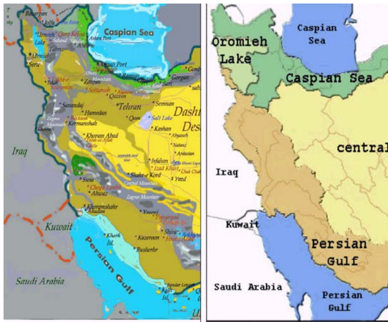
Iran Climatological map Main basins of Iran